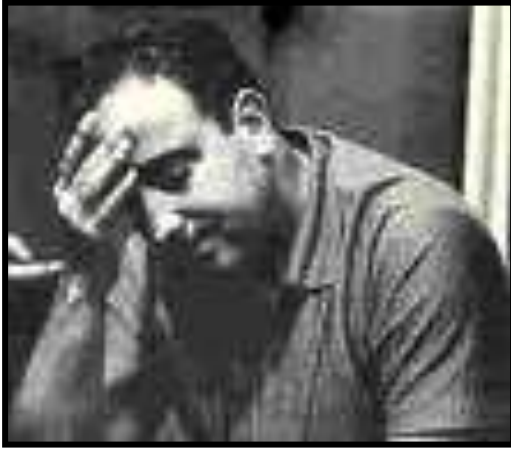
Grand Blanc MI

Despite everything else that's going on at the Bermuda Regional, some of you found the time to respond to our first Bridge Boffin Caption Competition. Thank you for your suggestions and here are some of the best: