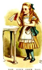
HOW ALICE GREW TALL

Just like Alice, you, too, can find your own Wonderland after a few Regional Bridge Specials.